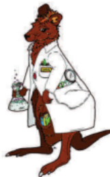
Sybil the Scientist