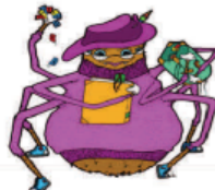
Yolanda the Yarnspinner