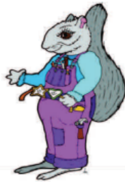
Isabel the Inventor