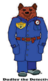
Dudley the Detective